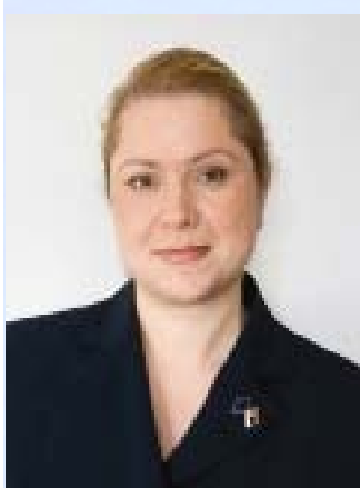
H.E. Ms. Jasna Matic - Serbian Minister for Telecommunications and Information Society

The Minister for Telecommunications and Information Society in the Government of the Republic of Serbia, H.E. Ms. Jasna Matic stated that the priorities in the work of the Ministry will be popularization, development and expanding ICT use in Serbia and eGovernment development on various levels of the state administration. Minister Matic announced that the postal company “PTT Srbija” will begin using electronic signature this fall, expressing expectation that at the beginning of 2009, e- services of the Government will be available to the public. She also pointed out that wireless broadband WiMAX licences will soon be approved for the licence-holders that are already present in country and region. This technology will increase the broadband Internet availability for citizens and businesses. The Minister underlined that it is necessary to work on raising the awareness of the public on importance of ICT use in today's modern economy, since the significance of this sector has not been recognized in Serbia still.